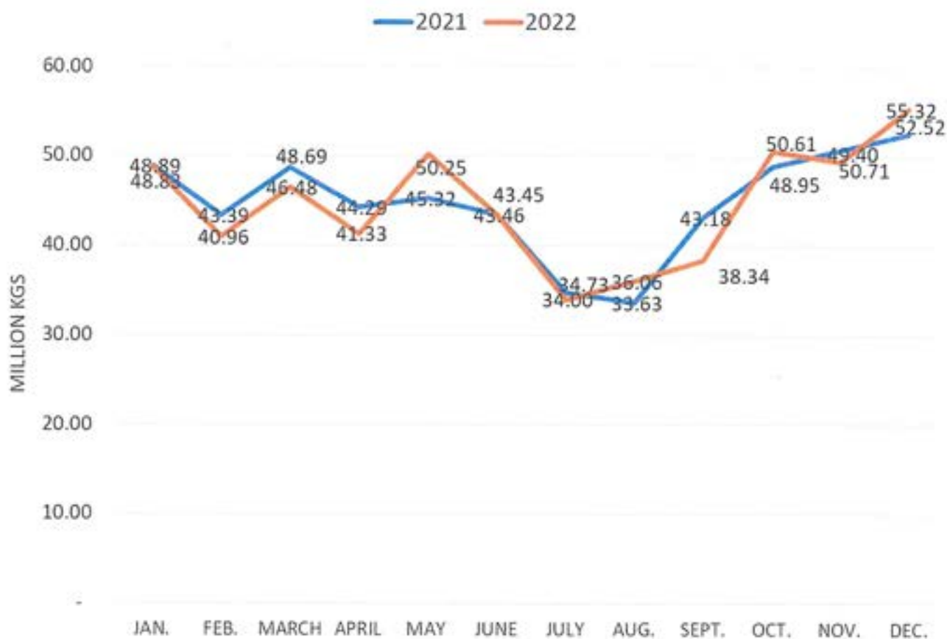
Tea Production Trend (2022 Vis.-a-vis. 2021)